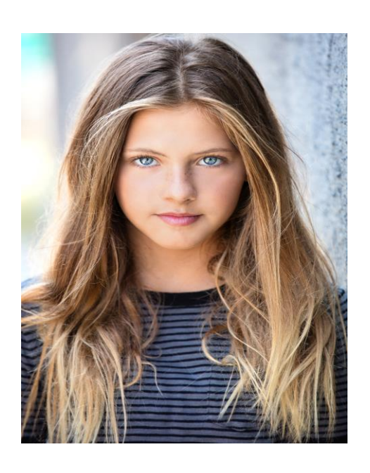
http://www.maxbrandinphotography.com/wp-content/uploads/2016/11/FNL AMX 1552 WEB.jpg

https://www.youtube.com/watch?v=0zQebR 1JBw