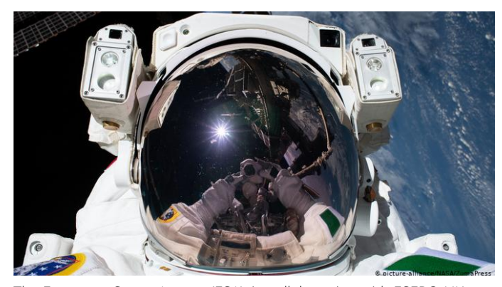
The European Space Agency (ESA), in collaboration with ESERO-UK, has launched new home editions for five of their key educational programmes: Mission X, Climate Detectives, Moon Camp, CanSat and AstroPi. Open from 12 May to 4 September.

They are all-inclusive activities for young people between the age of 4 and 18, plus every participant will get a certificate. www.esa.int/education